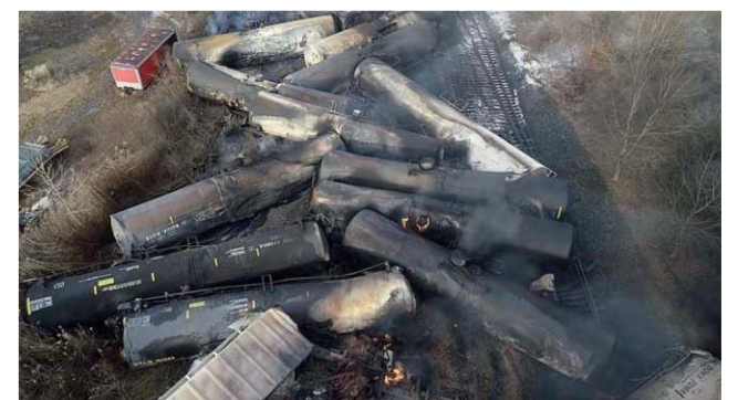
36 train derailments so far this year and counting: Arizona, West Virginia, South Carolina x3, Texas x3, Ohio x5, Oklahoma x2, Michigan, Nebraska, Californian x3, Philly, Alabama x2, Alaska, Louisiana, Florida, Massachusetts, North Dakota, Minnesota, Montana, Pennsylvania, Virginia, Maine, Illinois x2, Kansas...

Yet the trillionaires behind the so-called climate emergency never once talk about cleaning up our only home: Earth. If they really cared about Earth and our health and well-being, which is directly connected to nature, wouldn't they be worried about the massive pollution that is affecting us all? This alone proves that it's a made up emergency just like the plandemics past and present.