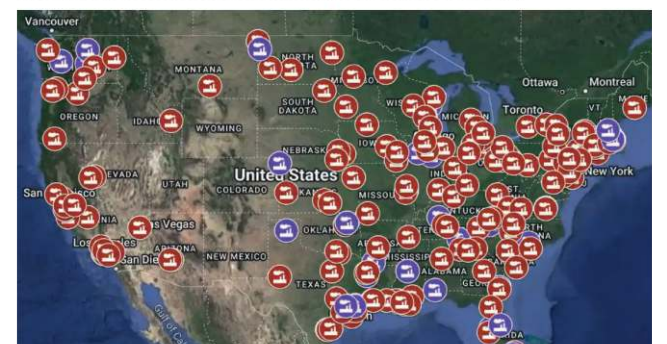
https://amp.theguardian.com/us-news/2023/feb/25/revealed-us-chemical-accidents-one-every-two-days-average , LINK

Guardian analysis of data in light of Ohio train derailment shows accidental releases are happening consistently