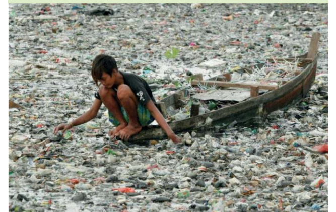
There is no climate crisis. There is a pollution crisis.

Yet the trillionaires behind the so-called climate emergency never once talk about cleaning up our only home: Earth. If they really cared about Earth and our health and well-being, which is directly connected to nature, wouldn't they be worried about the massive pollution that is affecting us all? This alone proves that it's a made up emergency just like the plandemics past and present.