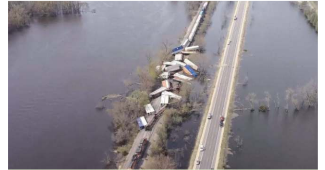
What are the chances, that the trains always derails right on big waterways, where they can pollute the most?

"If they knew what we have done, they would chase us down the streets...", George Bush Senior