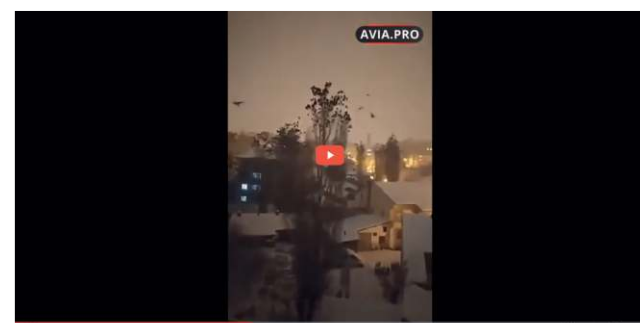
In Turkey, strange behavior was observed in birds just before the earthquake, LINK

As always, the video footage and photos in the post below tell a story which can only be conveyed by clue-laden pictures. For example, the large flocks of agitated birds in the video that follows were clearly trying to tell the local population something is very wrong. Yes, animals always act strange and leave the area before an earthquake but perhaps these birds were being adversely impacted by the super-energy weapons just prior to these 2 big earthquakes in Turkey.