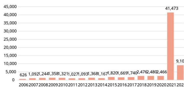
Florida Health: Health Alert on mRNA Covid-19 Vaccine Safety, 15 February 2023, LINK

In Florida alone, there was a 1,700% increase in VAERS reports after the release of the covid-19 injection. The reporting of life-threatening conditions increased by over 4,400%.