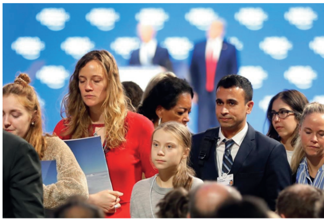
Behind Greta – Luigi Di Maio (born 6 July 1986) is an Italian politician serving as Minister of Foreign Affairs since 5 September 2019

The house of the Rothschild bankers reluctantly confirms the undeniable. Greta Thunberg is a blood relative of the notorious Rothschild chain of nation-buyers. It explains much about the precocious adolescent's celebrity status drooled over by presidents and prime ministers – and, of course, the slobbering 'on-message' media barons of the Western swamps.