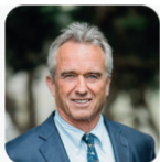
Robert F. KENNEDY, Jr. President of Waterkeeper Alliance, Chief Legal Counsel for Children's Health Defense